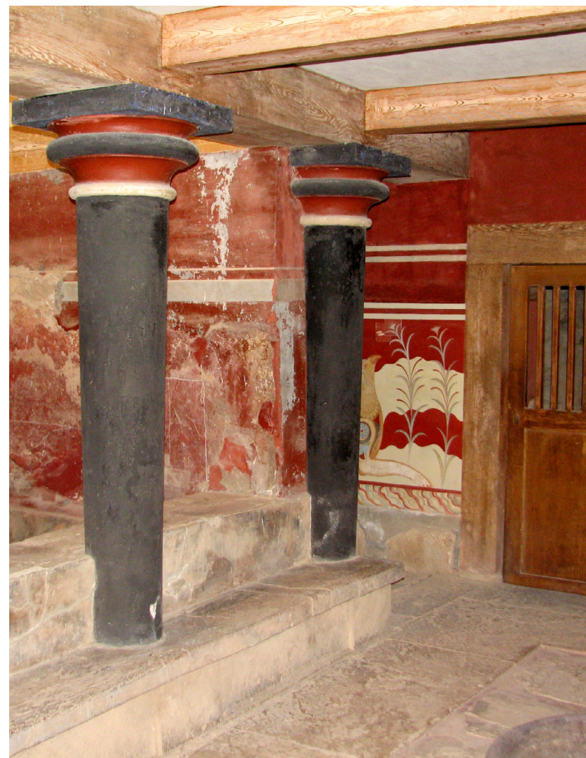
Knossos Palace: The throne chamber

** Participants wishing on return flights from Heraklion Airport may follow the trip and then stay at Heraklion.