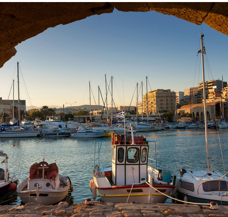
Heraklion Venetian Harbour

Don't miss an unforgettable visit to the lost world of the Minoans. Their palace at Knossos, which dates back to circa 2000 BC, was vast and elaborate, with Europe's first paved roads and running water and beautiful frescoes. This trip will guide you through history at the home of the thriving Minoan civilization.