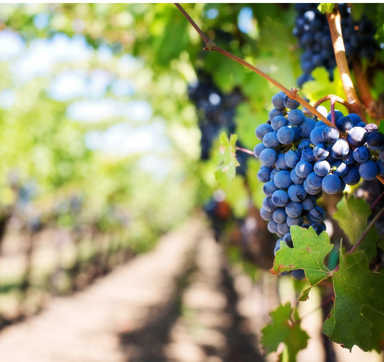
Manousakis winery vineyards

Enjoy the sea and sun in the exotic beach of Elafonisi with the pinkish sand and the turquoise waters. At noon, enjoy a wine & meze tasting tour at the famous Manousakis winery.