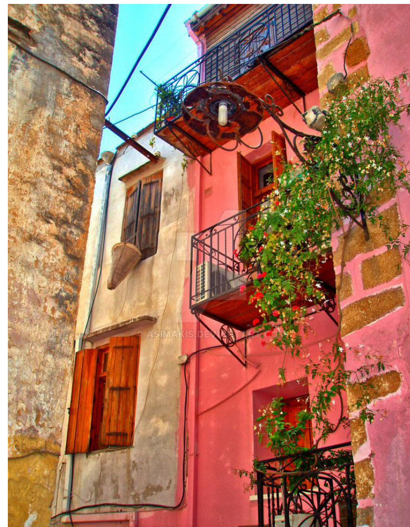
Chania Old Town